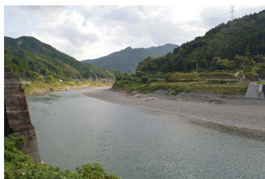
Before (right) and after (left) the removal of the Arase Dam